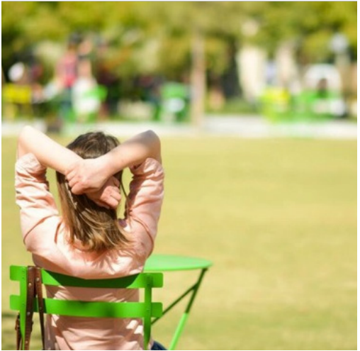
Klyde Warren Park

2012 Woodall Rodgers Freeway, Dallas 75201 214.716.4500 | KlydeWarrenPark.org