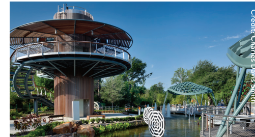
The Rory Meyers Children's Adventure Garden

DallasCowboys.com | Mavs.com | nhl.com/stars | mlb.com/rangers | fcdallas.com | wings.wnba.com