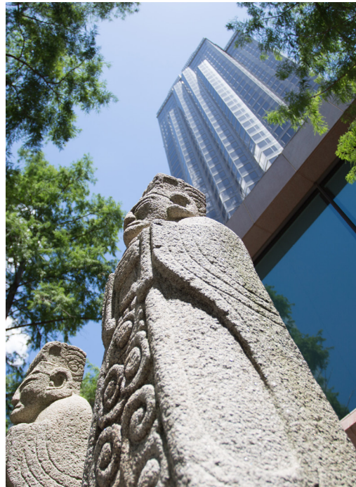
Crow Collection of Asian Art

2010 Flora St., Dallas 75201 214.979.6430 | CrowCollection.org