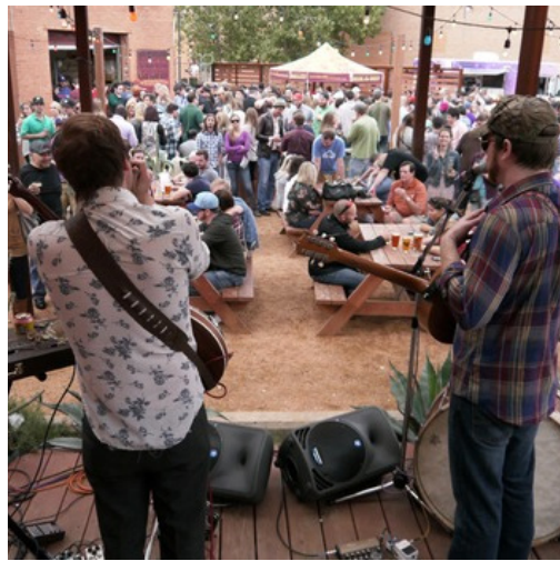
Deep Ellum Brewing Company

Dallas is a city of many sides. Here, Southern meets modern, legacy meets luxury and heritage meets hospitality - so come explore them all!